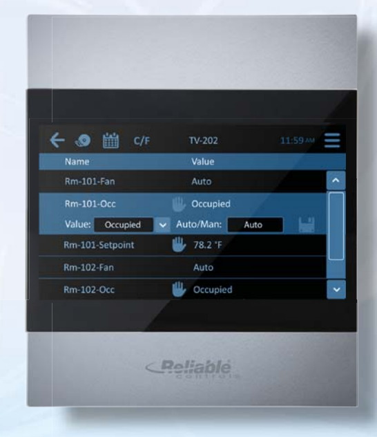
LISTview: allows ease of access for operators and end users to view and adjust critical parameters without having to enter the grow area.