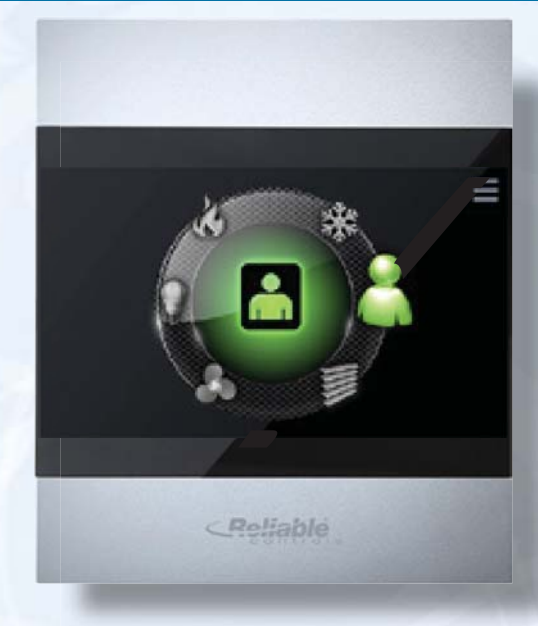
SPACEview: Graphical interface for accessing schedules, temperature control, lighting and dampers or blinds.