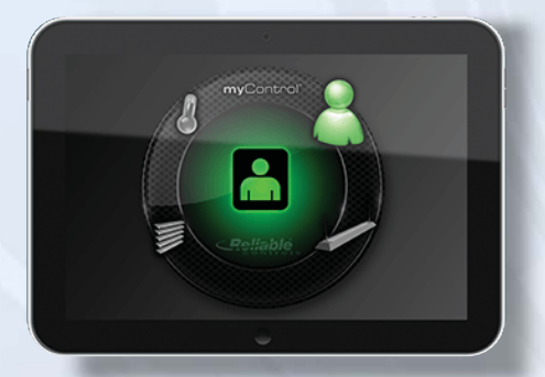
"myControl" App: free mobile app which is compatible with any smart device.